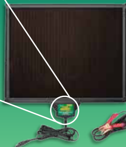
5 Watt Charger 270 mAmps Part#: 021-1163

The Worlds' 1st Solar Panel With Built-in Charge Controller