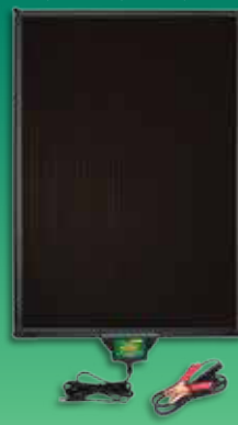
10 Watt Charger 540 mAmps Part#: 021-1164