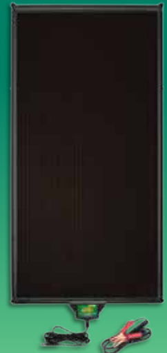
15 Watt Charger 830 mAmps Part#: 021-1165